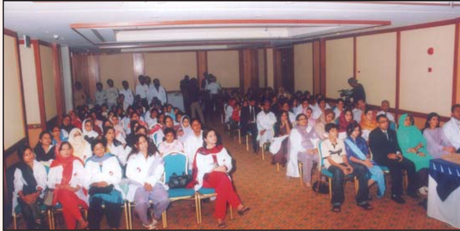
Monthly Seminar and training session for doctors and Para Medical Staff held on various topics with emphasis on mother & child healthcare.

We are pleased to inform that the organisation was established in 2002 and started its operation in 2003. CHAEF started establishing Primary Health, Mother & Child care Centres at suburban areas to save the poor and needy who do not have access to such facilities due to lack of awareness, poverty and ignorance. The patients are provided free consultation and initial diagnosis. Diseases like fever, TB, Malaria, Typhoid, Diarrhoea, High blood pressure, Diabetes and women related diseases are treated and medicines provided totally FREE of cost. Patients suffering from diseases like Cancer, Kidney, Heart, Eye, Hepatitis are referred to specialized hospitals. We are presently catering over 4500 patients daily with the help of 111 health and education activities at all our Primary Healthcare Centres and to date over 1821,361 diseases of patients have been treated and medicated including 46,378 ultrasound tests for MCH totally FREE of cost. CHAEF has also established a primary school, computer training and vocational training centers having 513 students. These services are being provided all over of Pakistan with the help of 110 staff at Karachi, Lahore, Faisalabad, Islamabad.