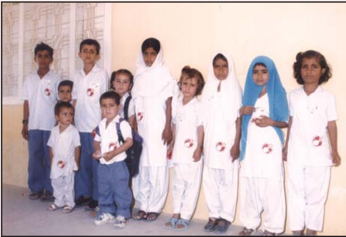
Group photo of some students of Govt Primary School at Soomar Goth. All the students of the school were provided uniform by the Children Health Education Foundation.