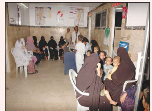
Patients waiting for consultation at Col (R) Jamshed Tarin Primary Healthcare Centre.