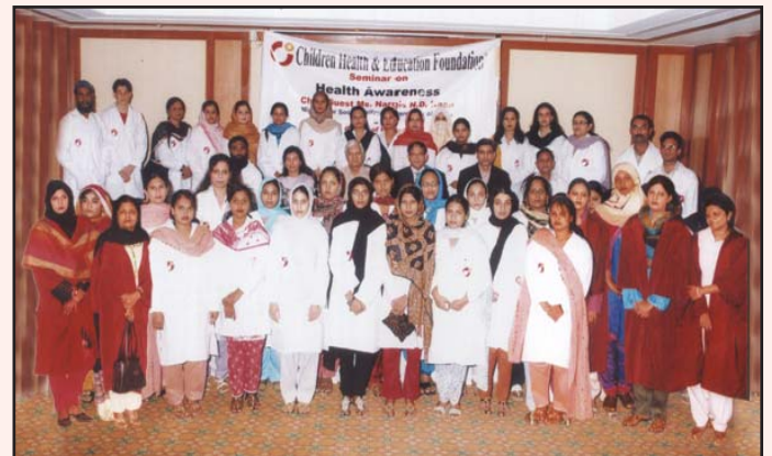
The Doctors & Teachers of Children Health & Education Foundation at Karachi at a monthly training seminar.