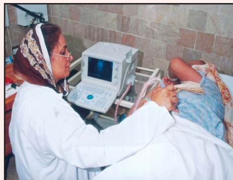
A patient being examined on Ultrasound Machine by a specialist doctor at Akhtar Colony Karachi.