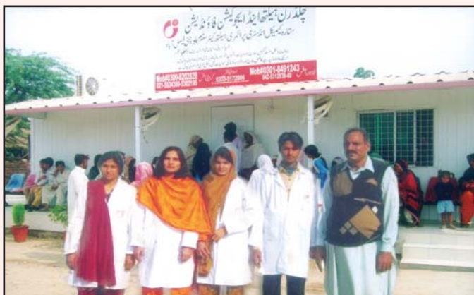
The dedicated staff at Faisalabad.