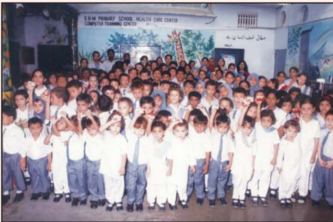
Students of EBM Primary School, Gulistan-e-Jauhar on the occasion of Hand Washing Day on 15th October 2008.