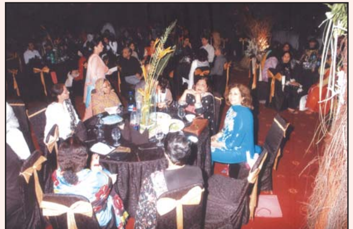
A view of the participants of Gala Dinner and Concert organised by Ikebana International Pakistan Chapter on 15th November 2008 to raise funds for the Children Health & Education Foundation.

The Layton Rahmatulla Benevolent Trust (LRBT) was Established in 1985. The following pioneer Managers of LRBT are now Associated with Chaef.