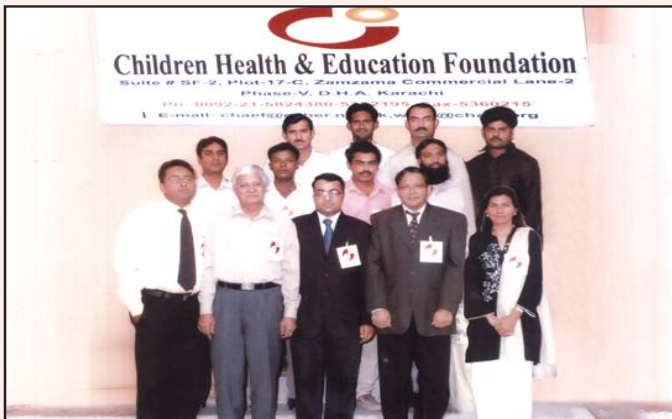
The team behind CHAEF at Head Office

We are pleased to inform that the organisation was established in 2002 and started its operation in 2003. CHAEF started establishing Primary Health, Mother & Child care Centres at suburban areas to save the poor and needy who do not have access to such facilities due to lack of awareness, poverty and ignorance. The patients are provided free consultation and initial diagnosis. Diseases like fever, TB, Malaria, Typhoid, Diarrhoea, High blood pressure, Diabetes and women related diseases are treated and medicines provided totally FREE of cost. Patients suffering from diseases like Cancer, Kidney, Heart, Eye, Hepatitis are referred to specialized hospitals. We are presently catering over 4500 patients daily with the help of 111 health and education activities at all our Primary Healthcare Centres and to date over 1821,361 diseases of patients have been treated and medicated including 46,378 ultrasound tests for MCH totally FREE of cost. CHAEF has also established a primary school, computer training and vocational training centers having 513 students. These services are being provided all over of Pakistan with the help of 110 staff at Karachi, Lahore, Faisalabad, Islamabad.