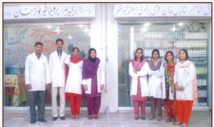
The dedicated staff of two centers at Lahore.