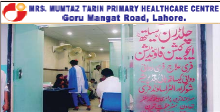
A view of Mrs Mumtaz Tarin Primary Healthcare Centre at Goru Mangat Road Lahore.

“The major issue faced by poor in our society is lack of basic medical treatment particularly early detection of diseases that can later become terminal. CHAEF is addressing this problem by opening Basic Health Clinics that provide free treatment, medical tests early detection of diseases and above all free medicines. All this is being done in a very novel way. Each center is being sponsored in some poor neighbourhood by generous individuals. I would urge you to do the same and serve humanity. GOD BLESS YOU.”