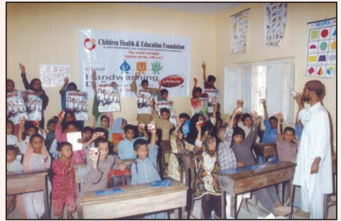
Children Health & Education Foundation participated with Unilever Pakistan to celebrate Hand Washing Day. Photo shows students of a primary school at Goth Mouladad.