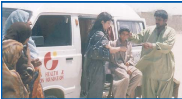
Our Mobile Van Conducting O P D at central location of 6 Villages at Hub Chowki/Kemari Division.

Your support will help us to provide the facilities to all other poor areas to save more lives.