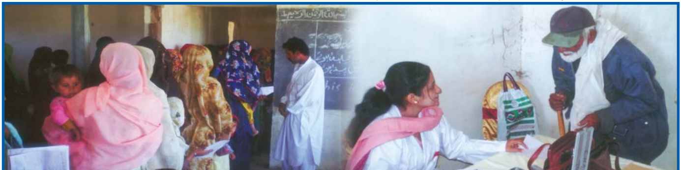
Mobile van carrying a doctor, paramedic and required medicines treating the patients at Mola Dad Goath.