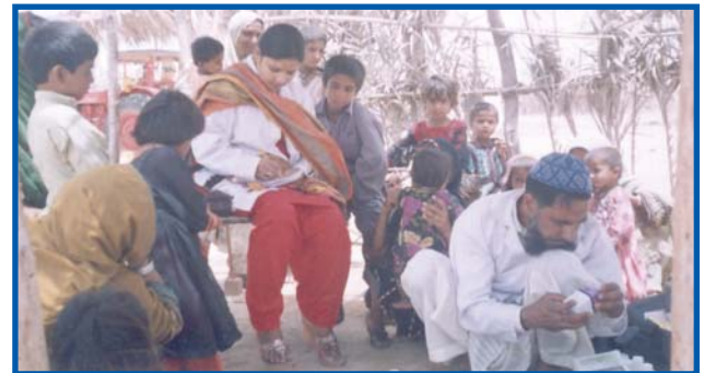
The Pictorial of a village near Karachi having no medical facility. CHAEF serves the patients through a mobile van carrying doctor, paramedic and medicines provided totally free.