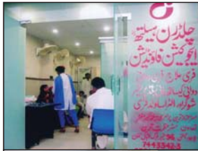
Mangat Road - Lahore -Primary Health Ultrasound and MCH Centre (3 activities)