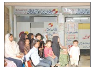
North Nazimabad Block R, Primary Health, Ultrasound and MCH Centre (3 activities)