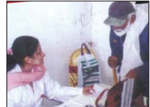
Memon Goth - Mobile Health Ultrasound and MCH Centre (3 activities), Gadap - Primary Health Ultrasound and MCH Centre (3 activities)

We have observed that a large number of poor and needy patients live in slum areas of cities and villages in extremely unhealthy conditions and have neither money nor access to any medical facility. These people suffer from minor ailments and availability of primary healthcare facility will save their lives.