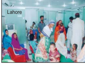
M.A. Johar Town Lahore Primary Health, Ultrasound and MCH Centre (3 activities)