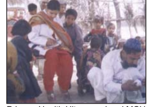
Primary Health Ultrasound and MCH at two goths (6 activities)

Please call or write for further information 0301-8235706 - 0301-8215709 E-mail: naeem@chaef.org