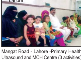
Mangat Road - Lahore -Primary Health Ultrasound and MCH Centre (3 activities)