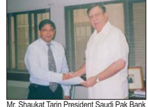
Mr. Shaukat Tarin President Saudi Pak Bank donating Ultrasound Machine to ChaeF