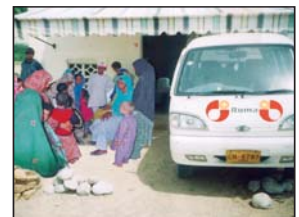
Soomar Goth - Primary Health Ultrasound and MCH Centre (3 activities)