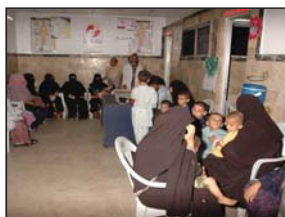
Akhtar Colony - Primary Health, Ultrasound and MCH Centre (3 activities)