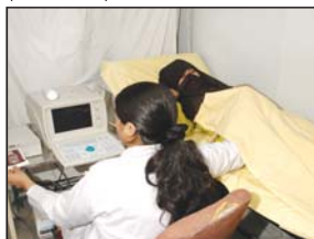
Sultanabad - Primary Health, Ultrasound and MCH Centre (3 activities)