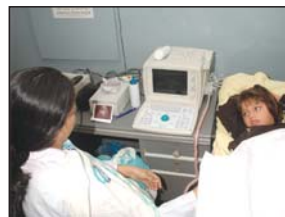
North Nazimabad Block S, Primary Health Ultrasound and MCH Centre (3 activities)