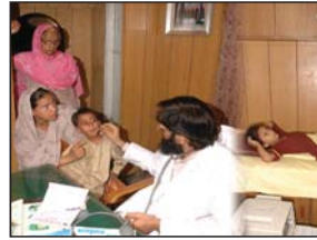
Nishtar Road - Primary Health Ultrasound and MCH Centre (3 activities)