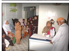
New Karachi - Primary Health, Ultrasound and MCH Centre (3 activities)