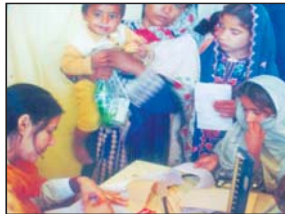
Primary Health Ultrasound and MCH at two goths (6 activities)