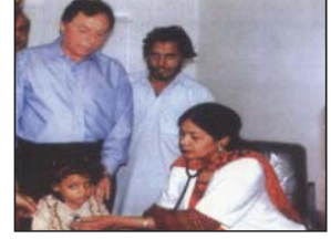
Metrovil - Primary Health Ultrasound and MCH Centre (3 activities)