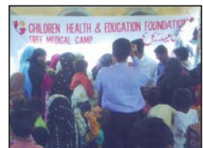
Bukhari Goth - Mobile Health Ultrasound and MCH Centre (3 activities)