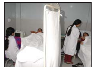
Shah Faisal Colony Block 4, Primary Health, Ultrasound and Mother & Child Healthcare Centre (3 activities)