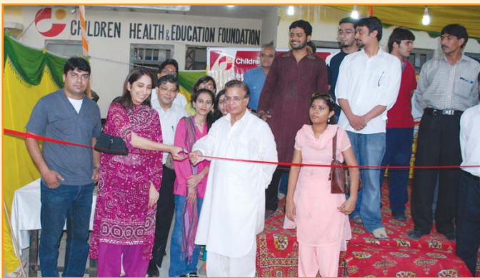
Opening of Primary Health, Mother & Child Healthcare & Ultrasound Centre by officers of HSBC

We wish to establish a model village "Khuda ki Basti" at Moladad Goth, 70 km from Karachi centrally located amongst 45 villages on Hub-Hawksbay Road, where we have so far successfully launched a Primary Health, Mother & Child Healthcare (Maternal Care) Ultrasound and Mobile Health Van Services at the junction of seven villages, a Primary School and Water Supply. On our continuous request a road from Hub to Hawksbay has been constructed and it is hoped that electricity to this area will also be available shortly.