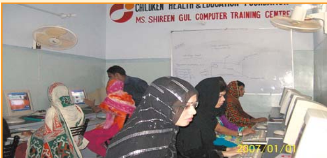
Shah Faisal Colony Centre – Karachi: FREE Computer Training Centre established in 2009