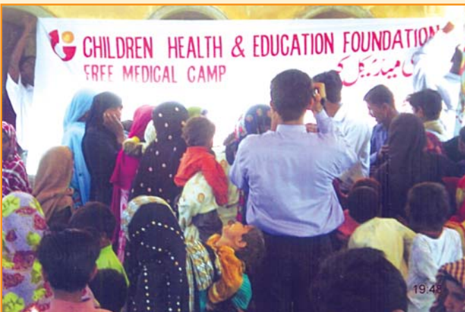
Bukhari Goth - Mobile Health Ultrasound and MCH Centre (3 activities)

Photographs of two of our mobile Primary Healthcare Centres at villages CHAEF is running 12 such mobile centres at various villages around the city, catering to over 400 patients daily.