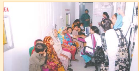
BP, Eye and weight being checked prior to examination by doctor.

We are committed to help the women by setting up the Maternal Care, Mother & Child Healthcare Centres as it seems that every women patient having a disease is related either to Gynecology, Obstetrics and Hormone imbalance.