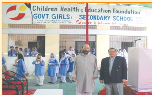
Main block building of Government Girls Secondary School at Sharafi Goth.