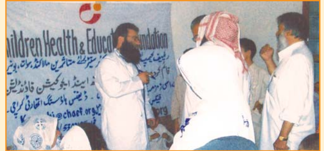
Malakand (Swat): Free Medical Camp established at Mardan to serve displaced poor people from Malakand.