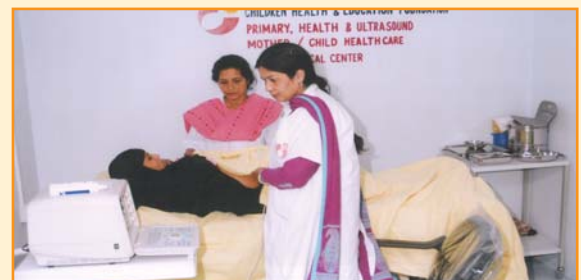
Ultrasound of the patient at the Centre.