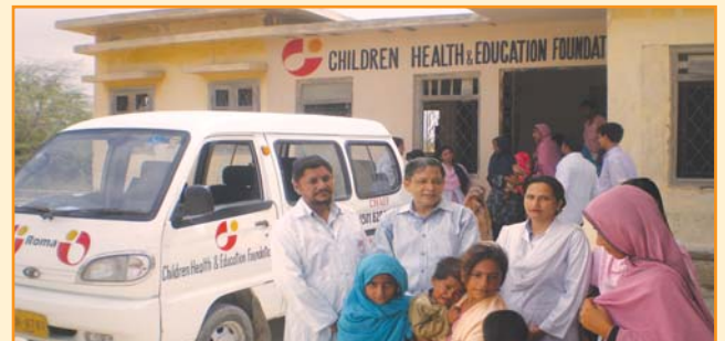
Goth Moladad (Hub) – Karachi: Free Primary Health, Ultrasound, Mother & Child Healthcare Centre established to support Mobile Health Van service covering 45 villages by setting up of Junction of 7 villages.