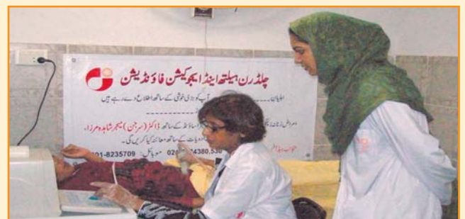
Pregnant patient being examined by the gynecologist under Mother and Child Healthcare Programme.