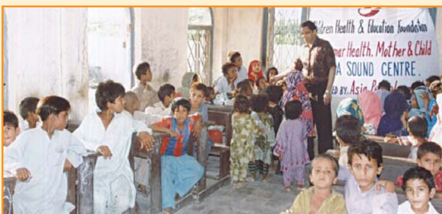
Goth Moladad (Hub) - Karachi: A school sponsored by Children Health & Education Foundation (CHAEF)