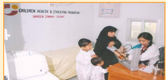
Patient being examined by the doctor.