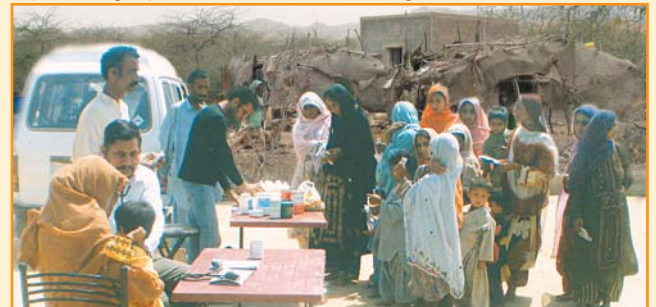
Hawksbay Road – Karachi: Mobile Healthcare Van providing daily services to the poor with Free medicines at a village on Hub-Hawksbay Road