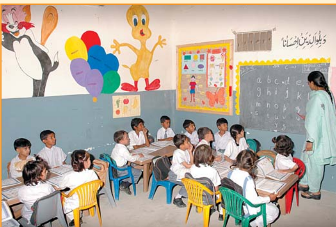
Students at KG section busy in their study.