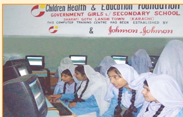
New Computer training facility provided by Children Health & Education Foundation.