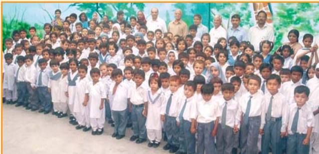
Gulistan-e-Jauhar Centre – Karachi: FREE CHAEF Primary School and Computer Training Centre