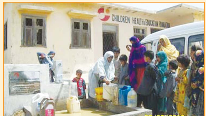
Hand water pump installed at Moladad Goth under Unilever Grant Scheme 2009. There was no arrangement of water supply in the area