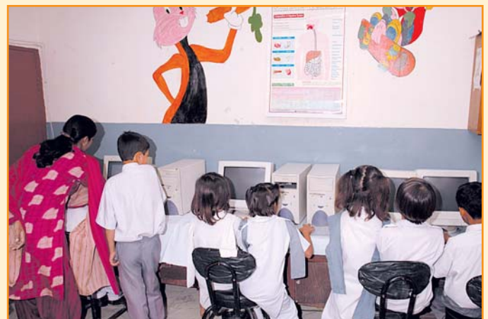
Students getting computer training at school computer laboratory.