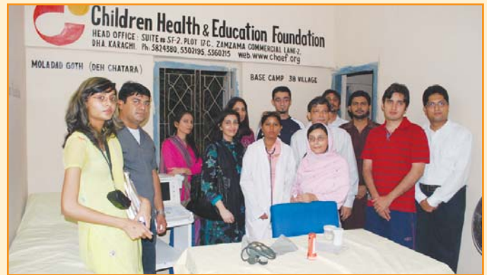
Photograph showing officers of HSBC with Medical Officer and Staff in OPD / Ultrasound Room at Moladad Goth