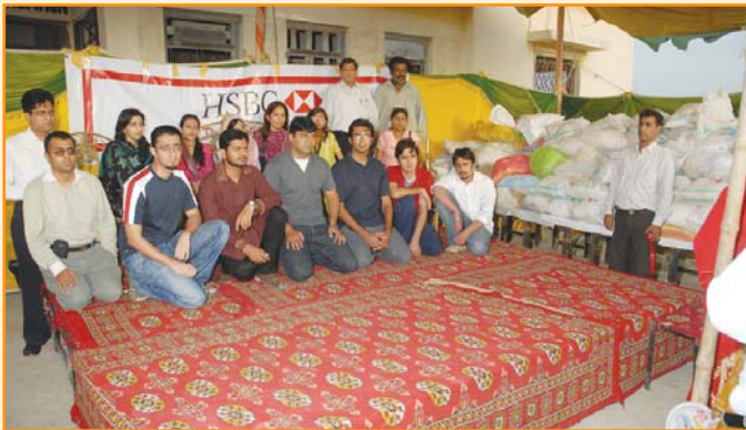
Distribution of food and other items with Iftar dinner to the poor residents of Moladad Goth surrounded by 44 villages on Hub Hawksbay Road hosted by HSBC.