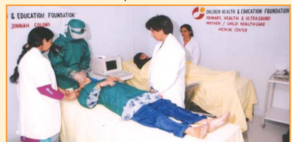
Operation Theatre (Can Be Used For Eye Surgery) and MCH.