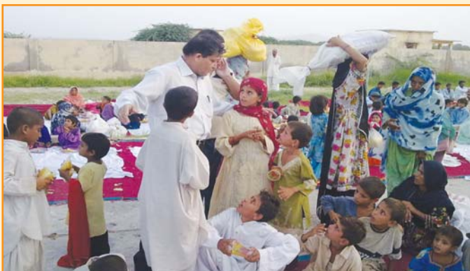
Food and other items of general consumption being distributed to the poor and needy residents of Moladad Goth and 44 other villages on Hub Hawksbay Road off RCD Highway to Balochistan