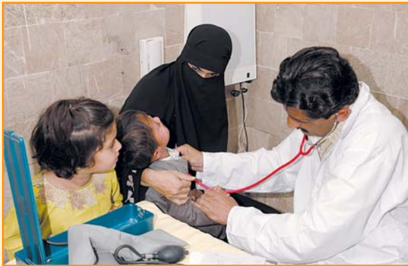
The doctor examining a child at the center.