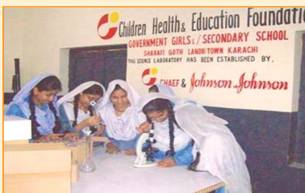
New Science laboratory established by Children Health & Education Foundation.