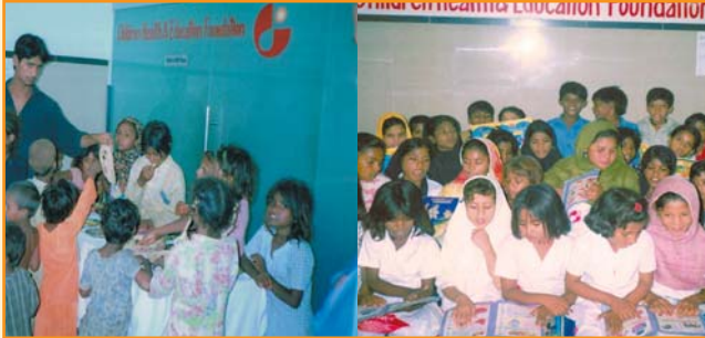
Johar Town Centre – Lahore: Poor students getting education with two meals

Children Health & Education Foundation is the only NGO providing FREE Healthcare and Educational facilities all over Pakistan to the poor and needy at locations where no such facilities are available as shown in the photographs