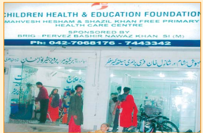
State of art Primary Health , ultrasound and Mother and Child Healthcare center established at M.A. Johar Town, Lahore.