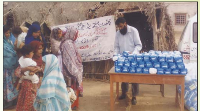
Unilever Pakistan and CHAEF had launched a campaign in winter for the protection of infant Children by donating 3,00,000 Huggies (Nappies) which have been distributed to poor mothers for Children up to the age of 3 years for hygiene and that the wet children could be saved from pneumonia. The activity was a campaign under our Mother and Children Healthcare program all over Pakistan.